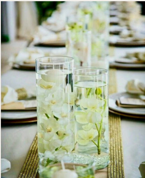
CANDLELIGHT SOIREE ~$27.50 EACH

Minimum 6 centerpieces per order unless stated otherwise