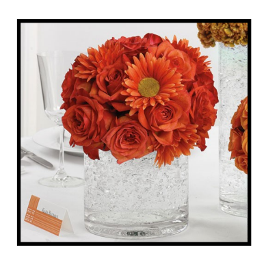
Birthday Vase ~$19.95 (assorted colors available)