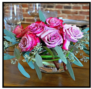
Victoria Rose Bowl ~$29.50