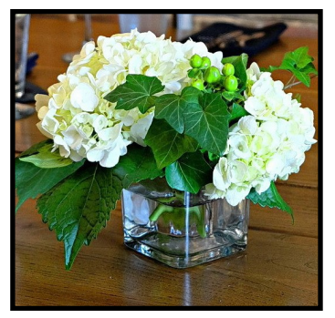
Celebration Cube ~$19.95

Prices are per centerpiece. You are welcome to take these centerpieces home with you at the end of your event. If there is something specific you are wanting, ask your event coordinator about custom packages. Vases may vary due to supply & availability. Minimum 6 centerpieces per order unless stated otherwise.