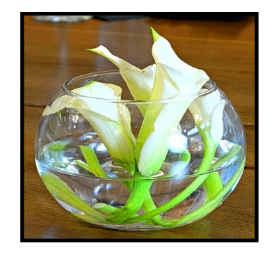
Modern Calla Bowl ~$26.50