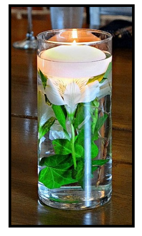
Candlelight Cylinder ~$20.50