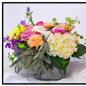
Seasonal Garden Vase ~$49.50 (minimum 4)