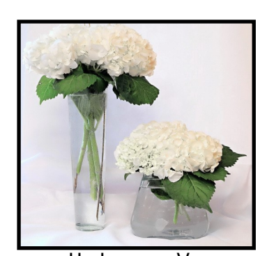
Hydrangea Vase (Tall or short) ~$24.50