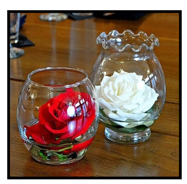
Penelope Rose Vase ~$12.50