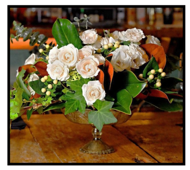
Downton Compote \sim $49.50 (minimum 4)